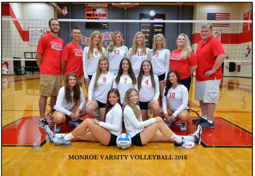
MONROE VARSITY VOLLEYBALL 2018