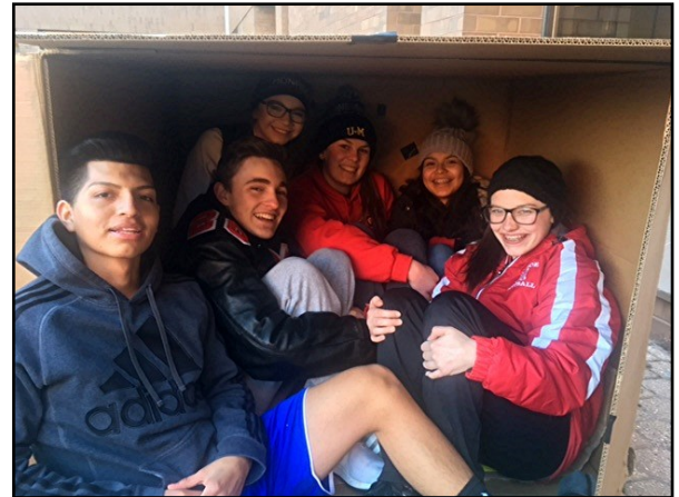
Members of the Monroe High School Interact Club participate in Homeless Awareness Week.