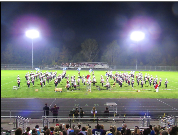
The Trojan Marching Band gave a stellar performance and earned a "Straight Ones" division rating at MSBOA Marching Band Festival on October 8 at Flat Rock High School.