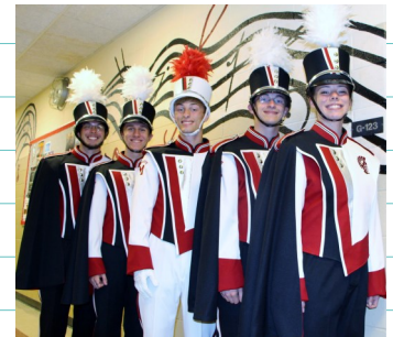
The MHS Marching Band will be styling starting this fall when they perform their half-time show in new uniforms.

Even with this adjustment, MPS lunch prices will still be lower than most other districts were last year.